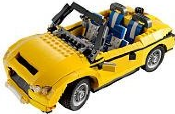
LEGO Creator Cool Cruiser