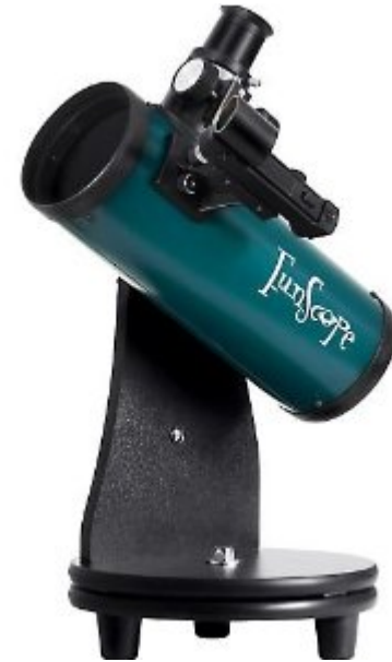
Tabletop Reflector Telescope